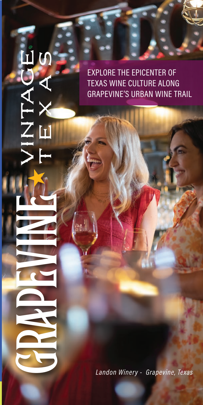
Landon Winery - Grapevine, Texas

EXPLORE THE EPICENTER OF TEXAS WINE CULTURE ALONG GRAPEVINE'S URBAN WINE TRAIL